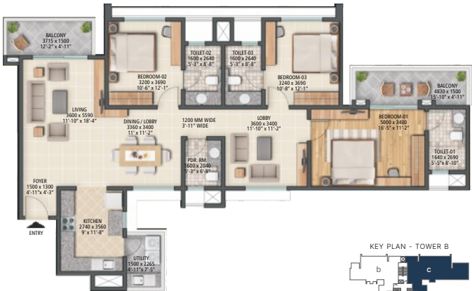
KEY PLAN - TOWER B

3 BEDROOMS LIVING AND DINING KITCHEN FAMILY LOUNGE / LOBBY 2 BALCONIES 3 TOILETS POWDER ROOM UTILITY SPACE